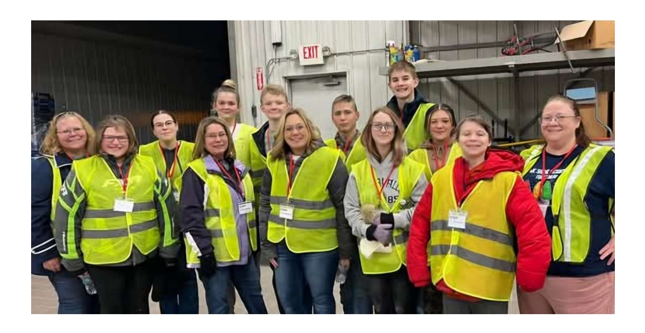
Serving at Ruby's Pantry

7^{\text{th}} – 12^{\text{th}} grade meets every Wednesday 7:00pm – 8:00pm