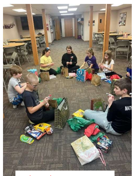
4<sup>th</sup> - 6<sup>th</sup> Grade Christmas Party