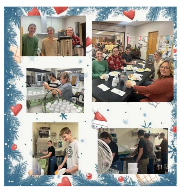
Serving the Christmas meal at the Four Seasons Center.

Serving and learning at the Roseau Food Shelf. We donated $340. And 290 pounds of food!! We are sharing kindness in Roseau County!